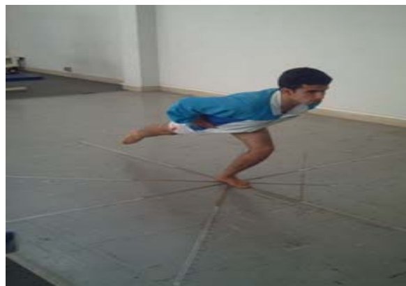
Figure 1 - A subject performing the posterior-reach component of the Star Excursion Balance Test.